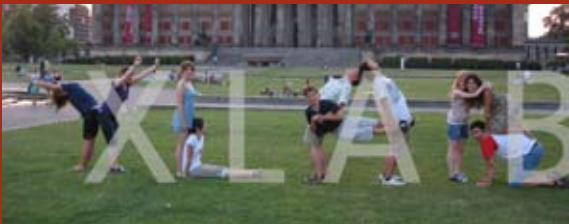
LIVING IN AN INTERNATIONAL SCIENCE COMMUNITY